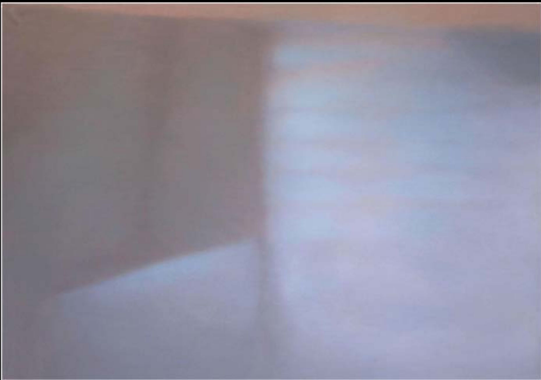
RR1 Oil on canvas 67"x45" 2007/08