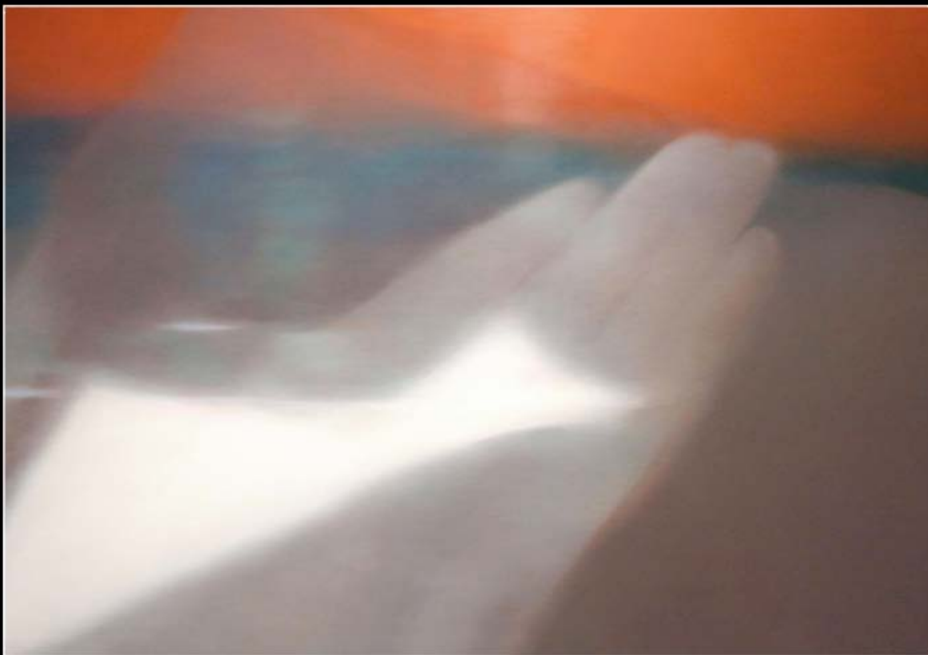
K3 Oil on canvas 51"x79" 2007/08