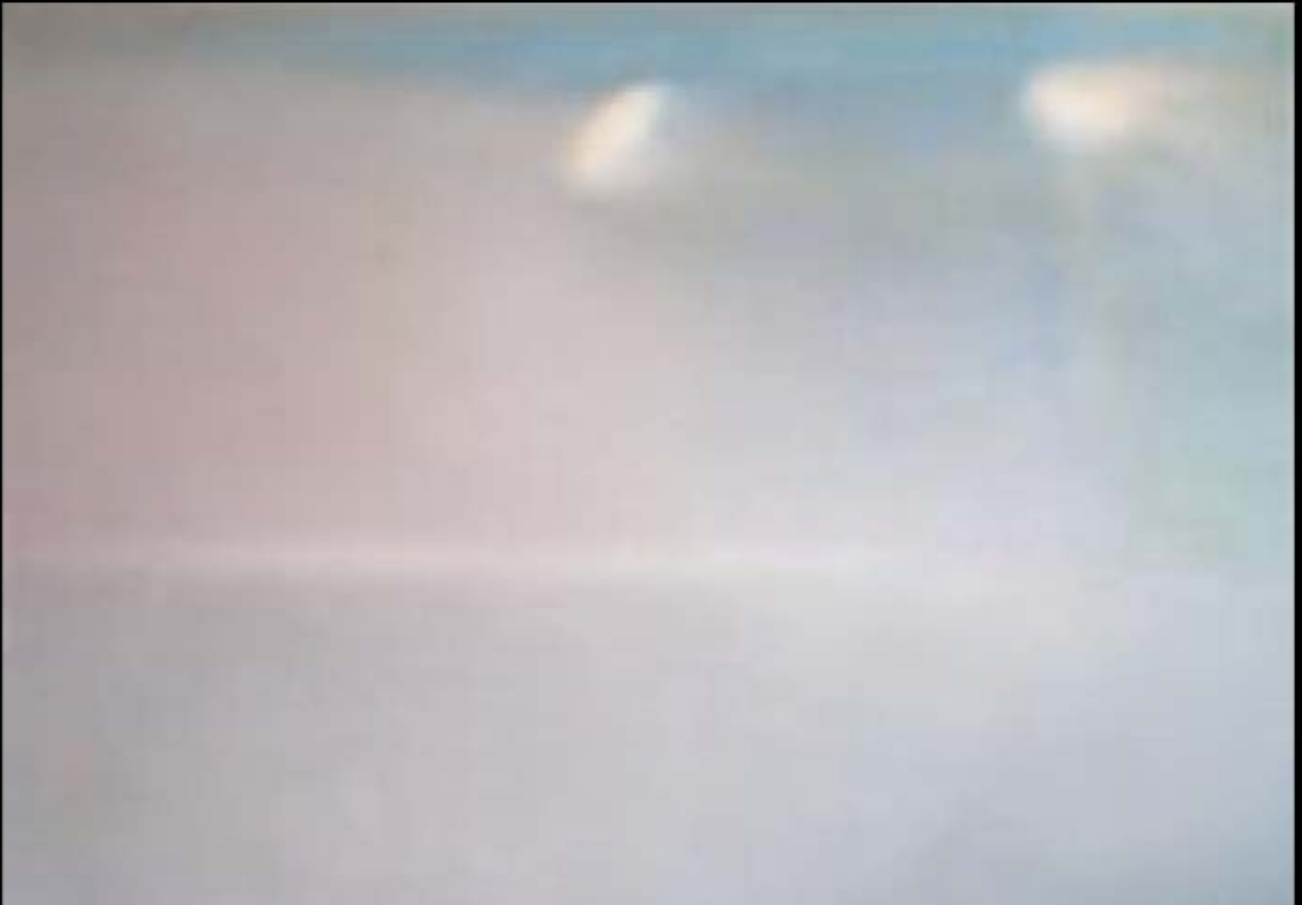
RR4 Oil on canvas 67"x45" 2007/08