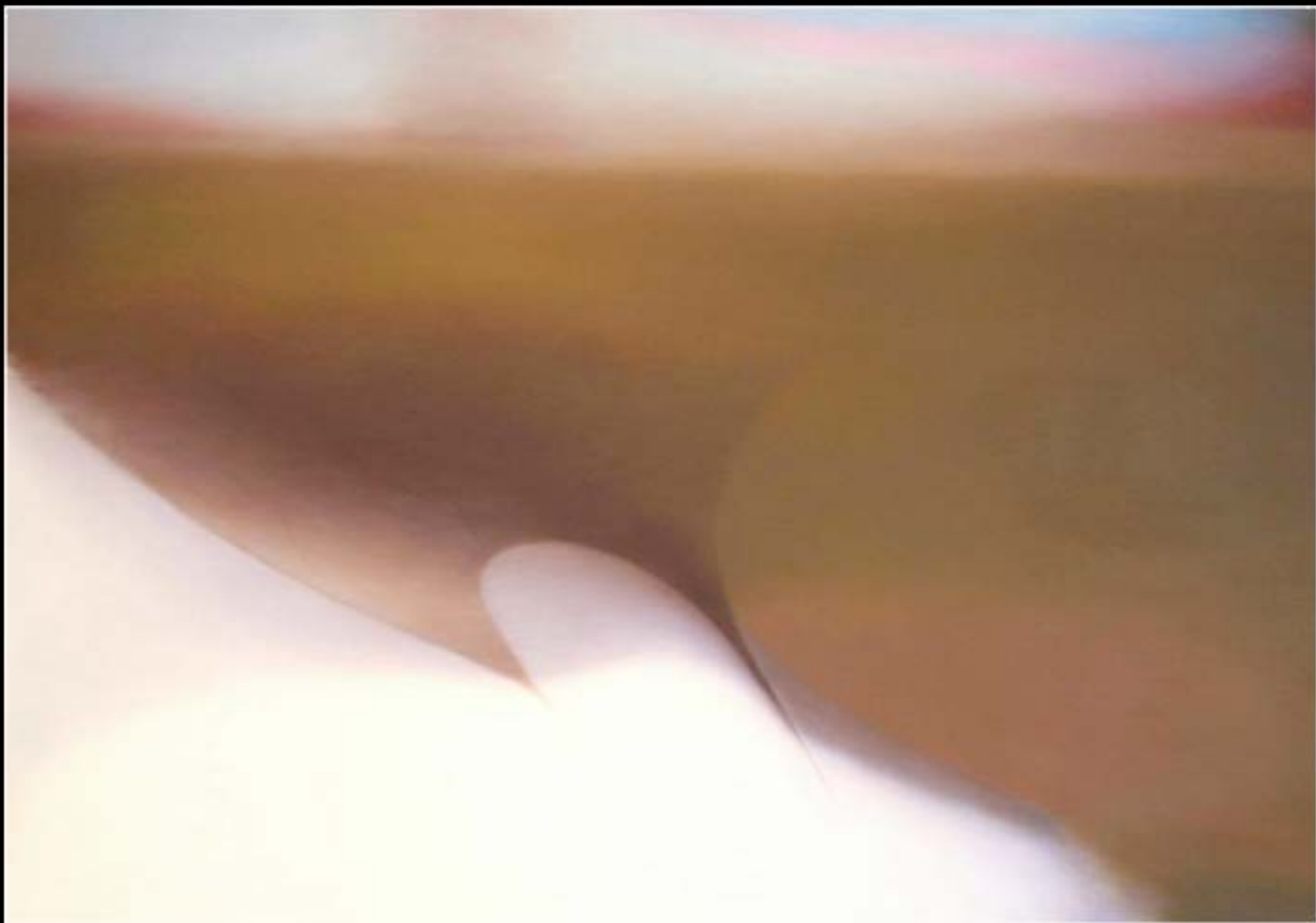
K4 Oil on canvas 51"x79" 2007/08