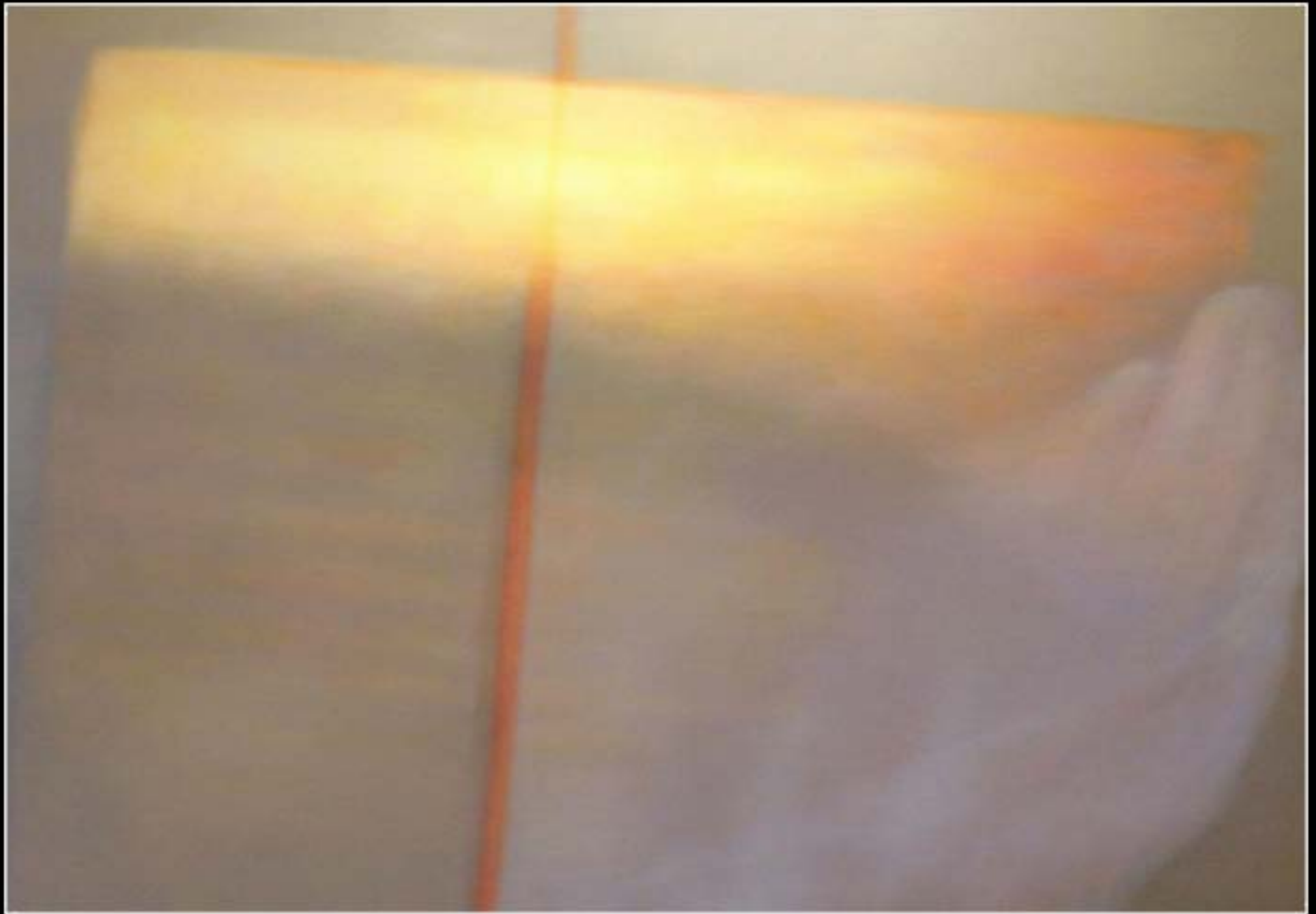
K1 Oil on canvas 51"x79" 2007/08